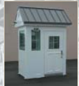
08 - 7I

Visit www.parkut.com to review booth building specifications, CAD drawings and an extensive option list. See many more examples of completed booths on site. An interactive RFQ questionnaire will help determine your requirements for your next custom Par-Kut steel building.