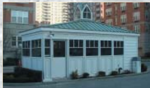
08 - 7E

PORTABLE OFFICES CUSTOMS INSPECTIONS TRAILER MOUNT BOOTHS CHECK POINT GUARDHOUSE HIGH SECURITY ENVIRONMENTS