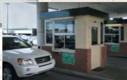
08 - 3E