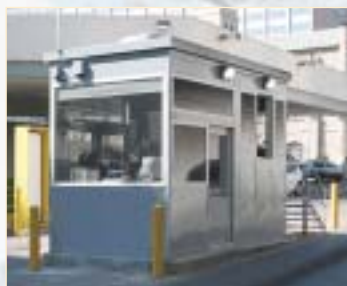
08 - 7F

PORTABLE OFFICES CUSTOMS INSPECTIONS TRAILER MOUNT BOOTHS CHECK POINT GUARDHOUSE HIGH SECURITY ENVIRONMENTS