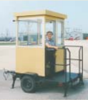
08 - 5C

Par-Kut industrial booth design may also include features such as removable access panels and double doors, impact resistant polycarbonate windows, transformers, three phase electrical panels, explosion proof wiring and devices, sound deadening and even blast resistant and fire retardant construction. For highly specialized applications, we offer custom design service too.