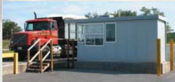
08 - 5E