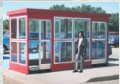
08 - 6H

Visit www.parkut.com for building specifications and an extensive options list specific to shelters, ticket booths and canopies. A user interactive RFQ questionnaire is available to assist in designing a Par-Kut portable enclosure to your exacting requirements.