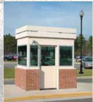
08 - 4C