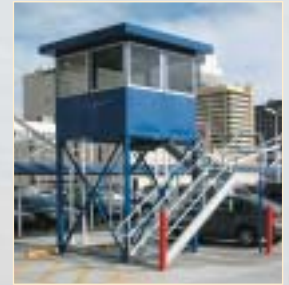
08 - 5I

www.parkut.com has detailed specifications as well as CAD drawings for your immediate inspection. An extensive options list, including those specific to industrial applications and an interactive RFQ questionnaire are also available on line.