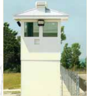
08 - 4B