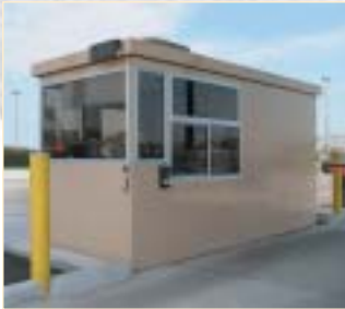
08 - 3G