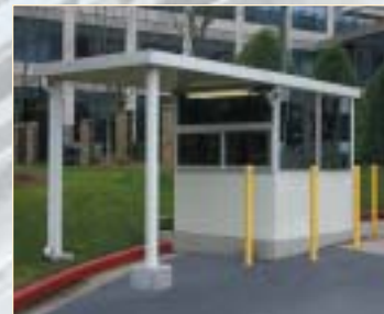
08 - 7H