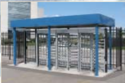
08 - 6F