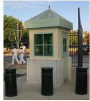
08 - 4A