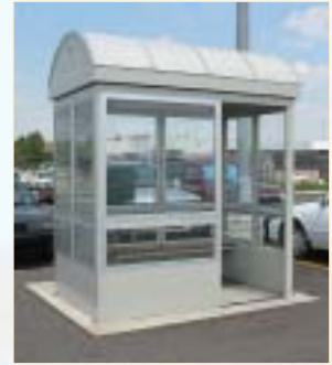
08 - 6A

Par-Kut can also provide shelters to keep parking customers and automated fee collection machines dry - available in both pre-built and site-built models, with or without light.