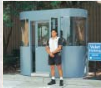
08 - 3H