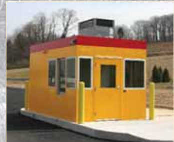
08 - 4E