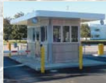
08 - 7G