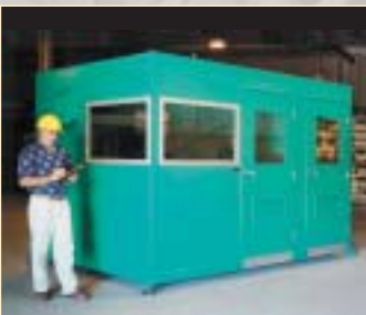
08 - 5D