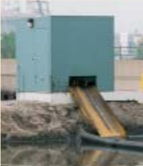
08 - 5B

Industrial enclosures are continuously subjected to extreme physical and environmental abuse. So Par-Kut booths are built tough - to stand up to the demands of low maintenance industrial settings. Starting with the integral strength of welded galvanized steel construction, Par-Kut booths are made to withstand the jarring and vibrations often present at the industrial site. And because an industrial booth rarely gets pampered, durable epoxy or polyurethane paint finishes resist the corrosion caused by contact with abrasive and toxic chemicals and continuous exposure to the natural elements. Even after years of service, a Par-Kut industrial booth remains the best looking in the field.