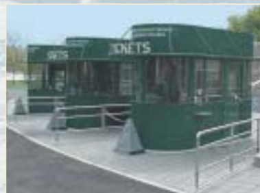
08 - 6G