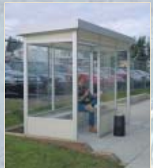
08 - 6C