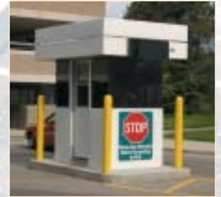
08 - 3I

Visit www.parkut.com to review booth building specifications, CAD drawings and an extensive option list. See many more examples of completed booths on site. An interactive RFQ questionnaire will help determine your requirements for your next Par-Kut parking booth.