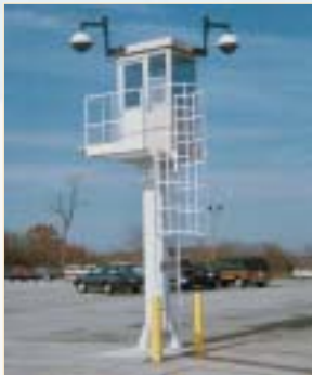
08 - 7C

Elevated or multi-story structures, appendages to existing construction, trailer mounted and even complete multi-room buildings are all within then realm of Par-Kut custom capability. With today's increasing demands for security enclosures, many custom bullet resistant projects require elaborate safety and defense features. Par-Kut combines design and BR construction expertise to meet the need.