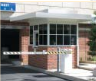
08 - 3F