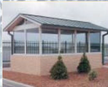
08 - 6D