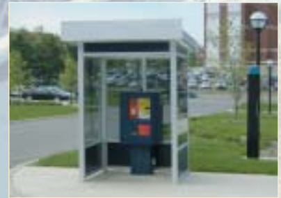
08 - 6E