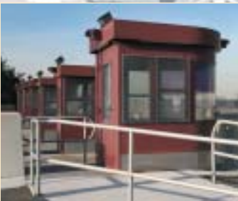
08 - 3D

SURFACE LOTS MUNICIPAL GARAGES ARENA & AIRPORT PLAZAS VALET & COMMERCIAL LOTS TOLL COLLECTION