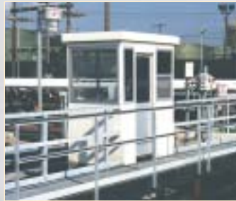
08 - 5G