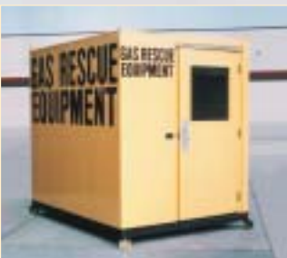
08 - 5F