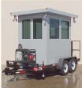
08 - 7B

Creating a one piece, all steel building to facilitate unique applications is not a new challenge to the Par-Kut design/engineering team. Par-Kut enclosures have been built to virtually any dimension and configuration to meet the most demanding specifications. Our durable welded construction process has stood the test of these specialized projects.