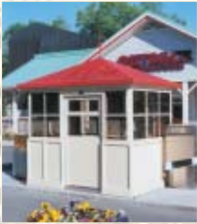
08 - 3A

As our name implies, parking was the industry upon which Par-Kut International was originally founded. Since 1954, Par-Kut parking booths have continued to provide the most durable and attractive protection for parking attendants. Manufactured one at a time - beginning with welded, galvanized steel construction, rugged Par-Kut booths outlast other steel, wood or aluminum buildings - in any environment. It's not surprising that Par-Kut booths are favored by today's parking industry professional, especially when factoring life cycle costing.