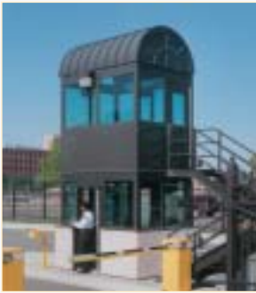
08 - 7A

Creating a one piece, all steel building to facilitate unique applications is not a new challenge to the Par-Kut design/engineering team. Par-Kut enclosures have been built to virtually any dimension and configuration to meet the most demanding specifications. Our durable welded construction process has stood the test of these specialized projects.