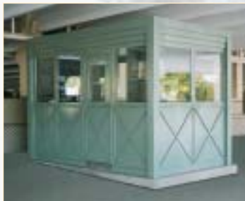
08 - 7D

Every Par-Kut portable steel building is custom to some degree. But if an elaborate or unique design is specified, Par-Kut has the expertise to provide a durable solution.