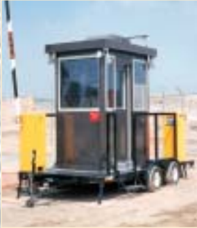
08 - 3B

As our name implies, parking was the industry upon which Par-Kut International was originally founded. Since 1954, Par-Kut parking booths have continued to provide the most durable and attractive protection for parking attendants. Manufactured one at a time - beginning with welded, galvanized steel construction, rugged Par-Kut booths outlast other steel, wood or aluminum buildings - in any environment. It's not surprising that Par-Kut booths are favored by today's parking industry professional, especially when factoring life cycle costing.