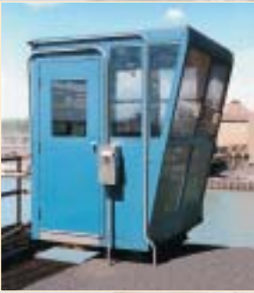
08 - 5A

Industrial enclosures are continuously subjected to extreme physical and environmental abuse. So Par-Kut booths are built tough - to stand up to the demands of low maintenance industrial settings. Starting with the integral strength of welded galvanized steel construction, Par-Kut booths are made to withstand the jarring and vibrations often present at the industrial site. And because an industrial booth rarely gets pampered, durable epoxy or polyurethane paint finishes resist the corrosion caused by contact with abrasive and toxic chemicals and continuous exposure to the natural elements. Even after years of service, a Par-Kut industrial booth remains the best looking in the field.