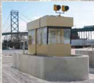
08 - 4D