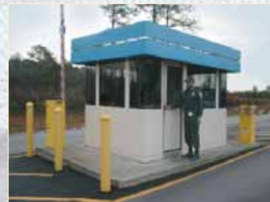
08 - 4H

Visit www.parkut.com for building specifications including bullet resistant construction. An option list specific to security buildings and a user interactive RFQ questionnaire is also available to assist in designing a Par-Kut Portable Security Building to your exacting requirements.