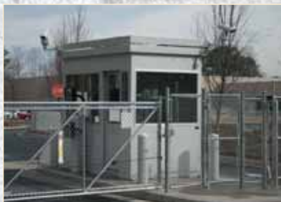
08 - 4F