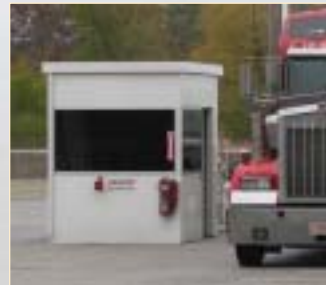
08 - 5H