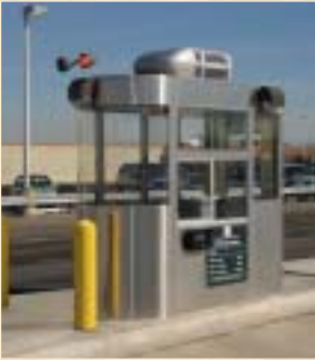
08 - 3C

In addition to our popular product line, Par-Kut portable parking buildings may be modified according to customer specification - often designed to complement existing architecture. Design considerations also include ADA compliance and/or restroom accommodations for extended occupancy. Booths may also be manufactured with bullet resistant construction. Par-Kut's list of options include many features exclusive to the parking industry - such as transaction windows and drawers, floor safes, security screens or shutters, lane lights and directional signage.