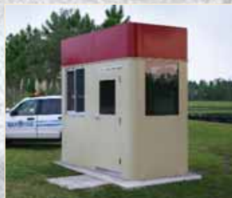
08 - 4G