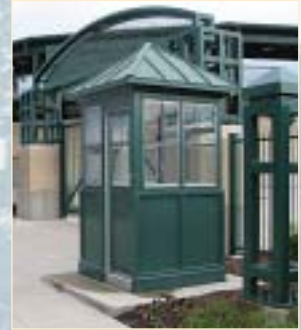
08 - 6B